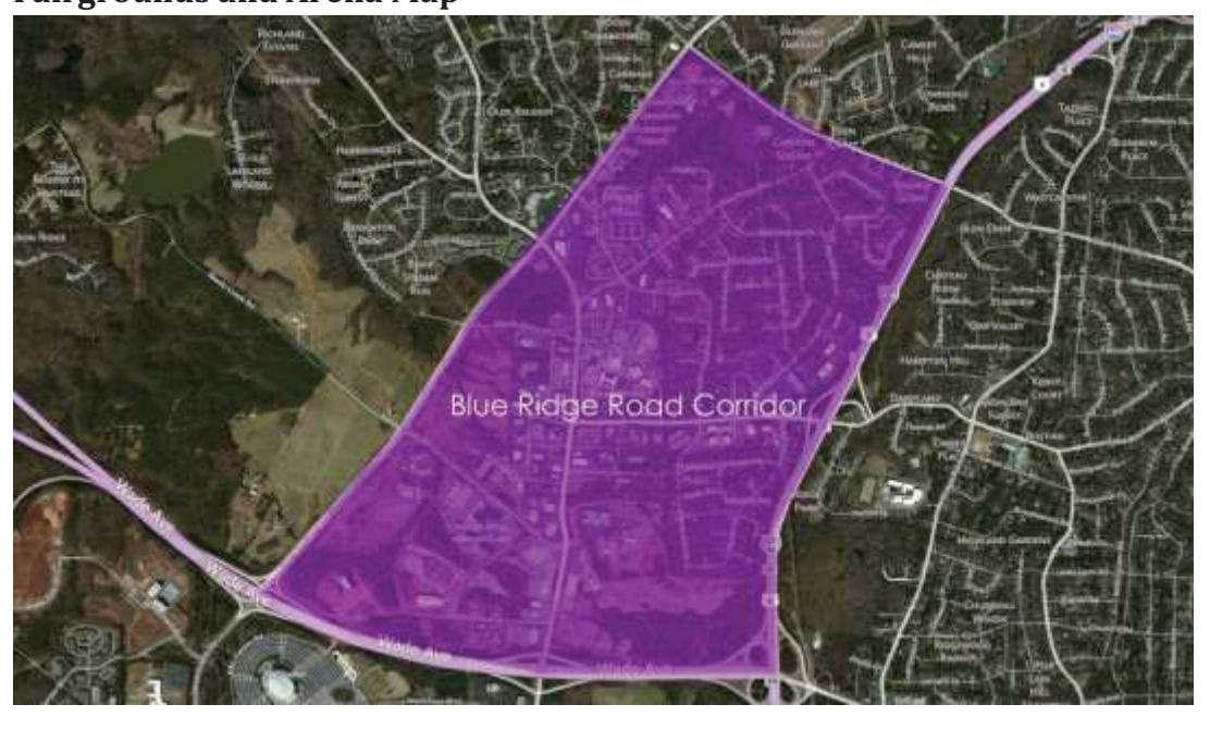
Blue Ridge Road Corridor Map