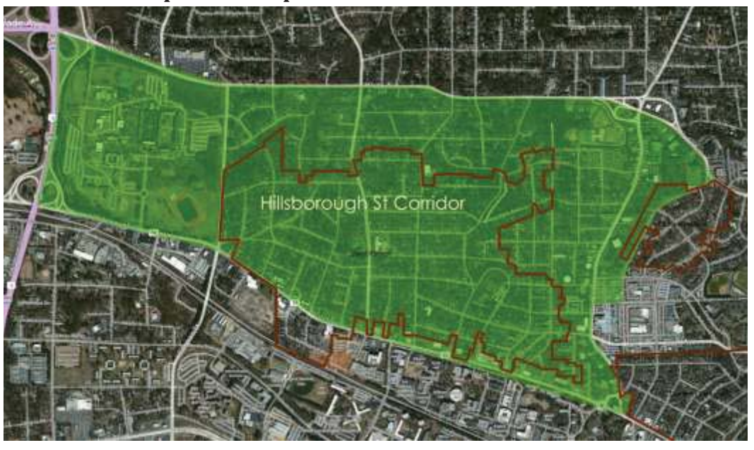
Hillsborough Street Corridor Map