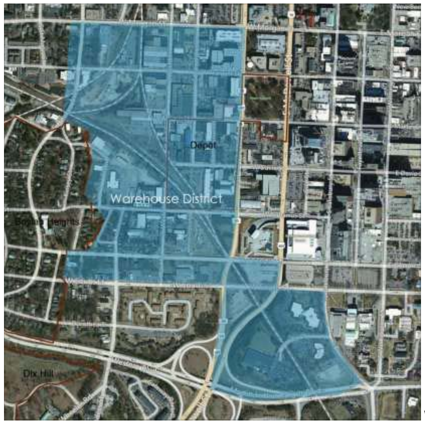
Warehouse District Map