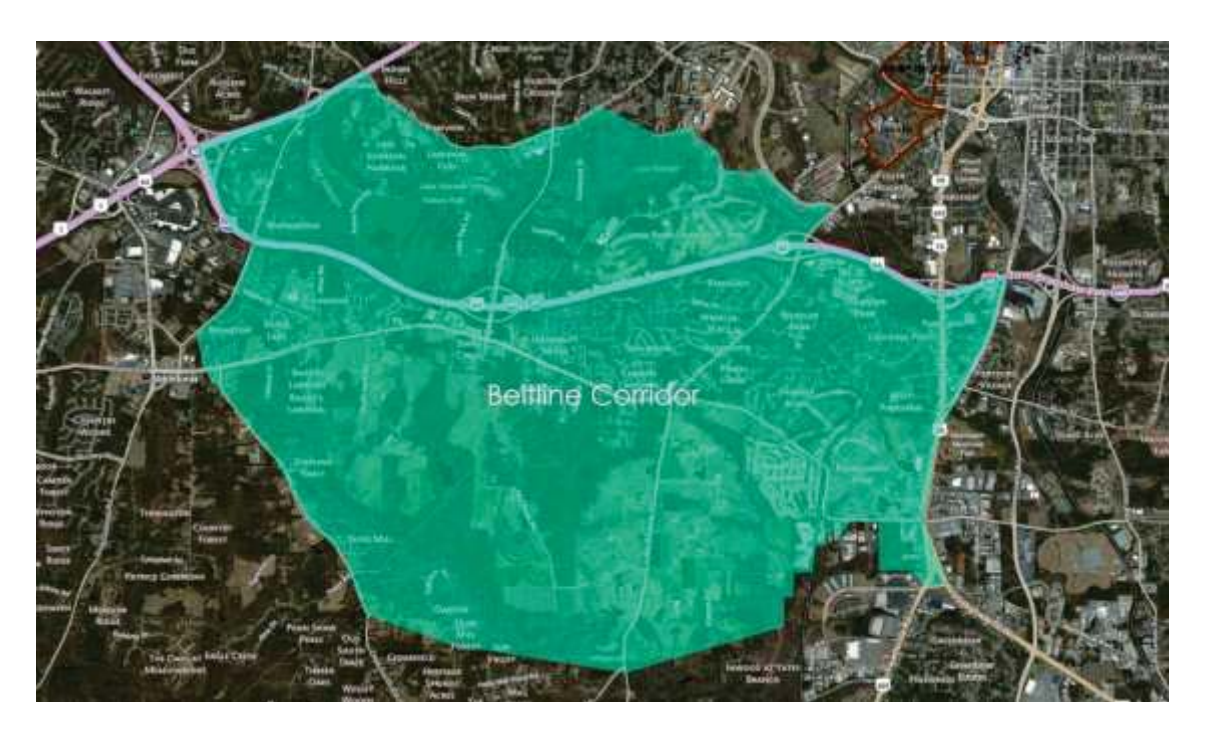
Beltline Corridor Map