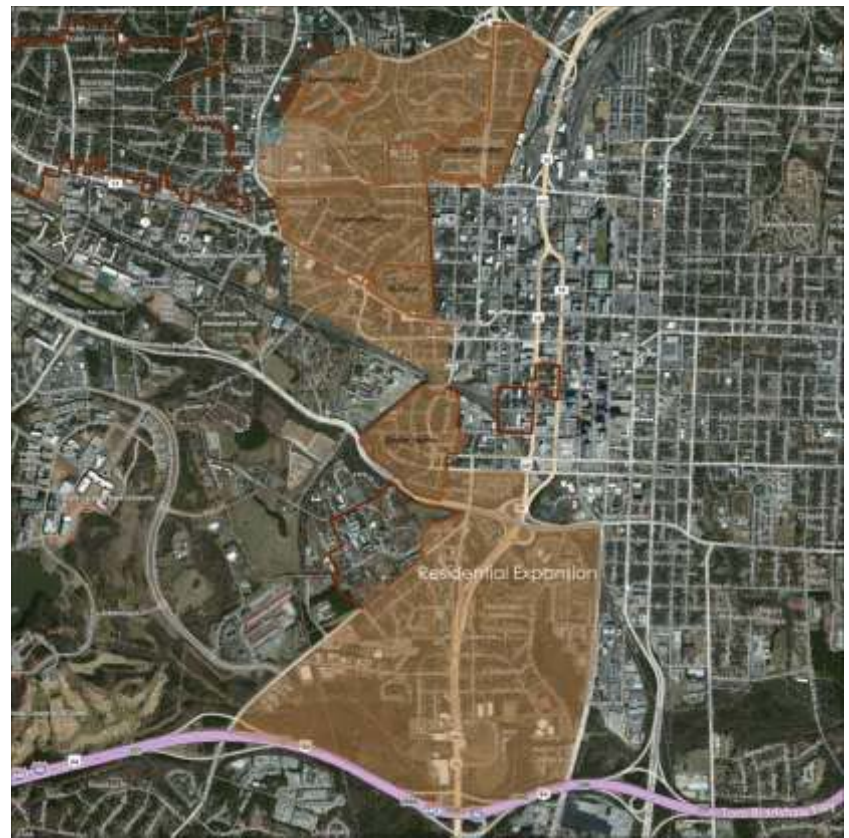
Residential Expansion Map