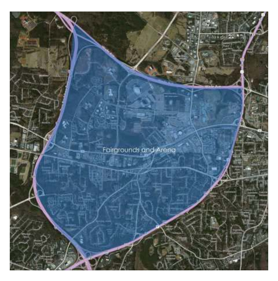
Fairgrounds and Arena Map